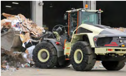
Volvo LX1 Electric Hybrid Wheel Loader

Wheel loaders are another electric hybrid machine we are exploring. In conjunction with Volvo Construction Equipment, we hosted two field tests for Volvo’s prototype LX1 electric hybrid wheel loader at our Redwood Landfill and Moreno Valley Transfer Station, both in California. Data was collected on the wheel loader’s fuel efficiency and GHG reduction against a conventional machine. The LX1 achieved approximately a 50 percent and 45 percent fuel efficiency improvement on average, at the Redwood and Moreno Valley sites respectively.