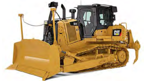
Our collection of Caterpillar D7Es is the largest fleet of hybrid bulldozers in the industry.

We also have the largest fleet of hybrid bulldozers in the industry, operating 42 Caterpillar D7E’s at 39 different landfill locations across the country. The D7E’s rate of hourly fuel consumption is on average six gallons less than the D8 tractors it replaces, translating into annual savings of nearly one half million gallons of diesel fuel.